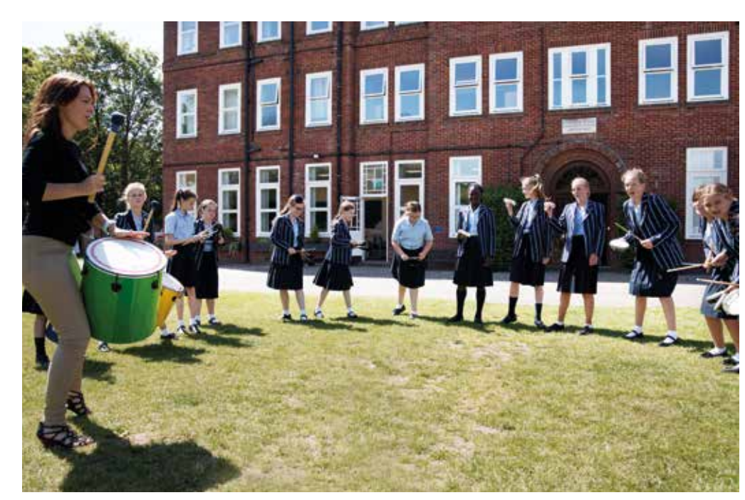
There is a thorough Induction Programme for new pupils and parents, with careful liaison between the Prep School and each child's current school, in an effort to make the process as seamless as possible.